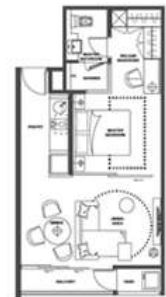
C: 497 sf