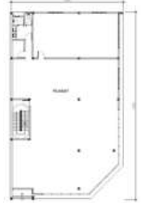
PELAN LANTAI TRINGKAT SATU