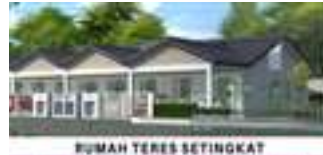
RUMAH TERES SETINGKAT

22' 0" x 92' 0" | 4 Bilik Tidur | 4 Bilik Mandi