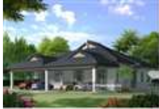
RUMAH BERKEMBAR SETINGKAT

22' 0" x 106' 0" | 4 Bilik Tidur | 3 Bilik Mandi