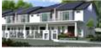
RUMAH TERES DUA TINGKAT

22' 0" x 106' 0" | 4 Bilik Tidur | 3 Bilik Mandi